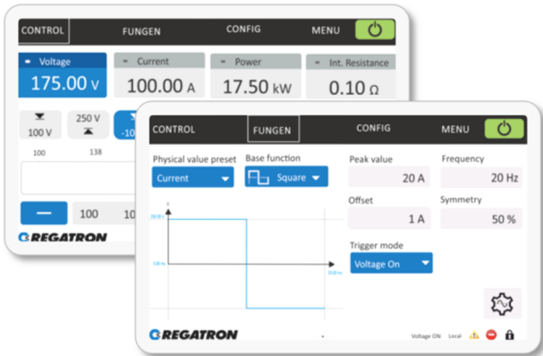
Figure 2: Intuitive control by HMI touch display. Everything you need at a glance.

The HMI built into the front panel allows comprehensive and convenient operation of the power supply via touch display.