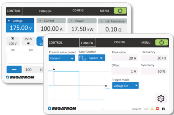
Figure 3: Intuitive control by HMI touch display. Everything you need at a glance.

The HMI built into the front panel allows comprehensive and convenient operation of the power supply via touch display.