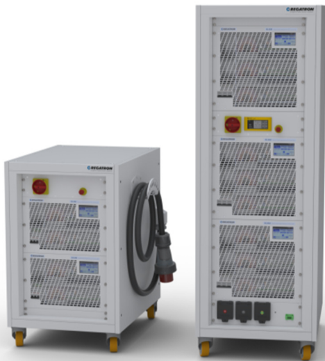
Figure 3: REGATRON's rack-integrated turn-key system solutions, e.g., 72 kW (left) and 162 kW (right) power levels. Various types of AC/DC connectors and cables allow for comfortable handling. Third-party product integration and numerous safety options are additional features.