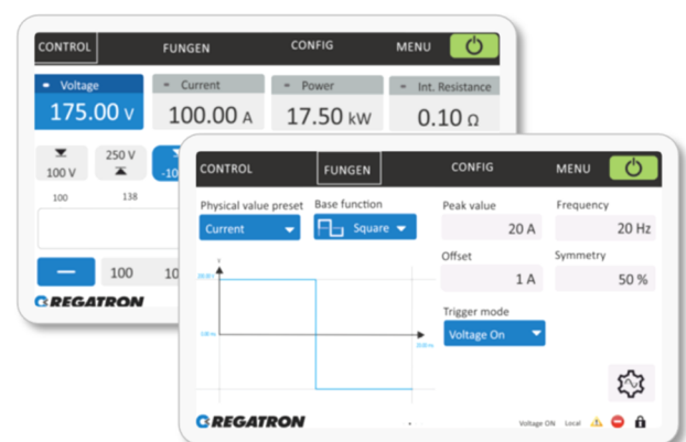
Figure 2: Intuitive control by HMI touch display. Everything you need at a glance.

The HMI built into the front panel allows comprehensive and convenient operation of the DC electronic load via touch display.