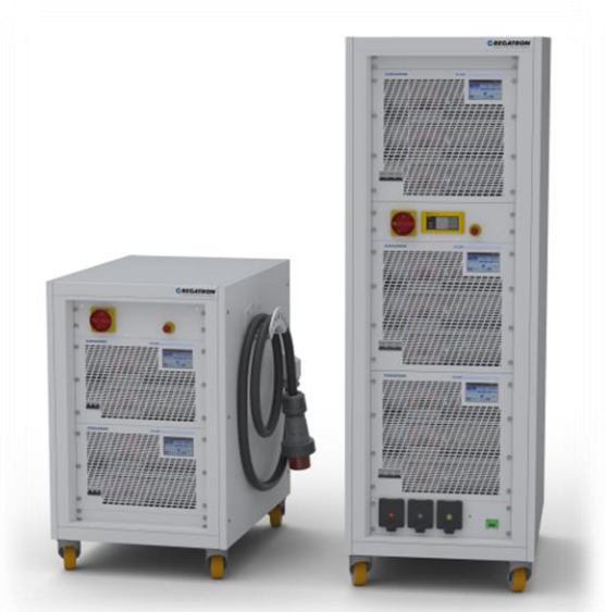
Figure 4: REGATRON's rack-integrated turn-key system solutions, e.g., 72 kW (left) and 162 kW (right) power levels. Various types of AC/DC connectors and cables allow for comfortable handling. Third-party product integration and numerous safety options are additional features.